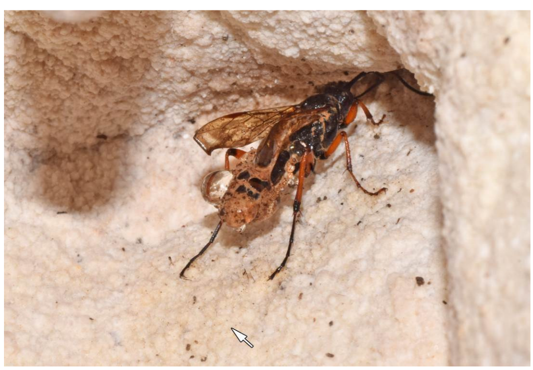
Figure 3. A dead female of the four-spotted cave ichneumon wasp, D. quadripunctorius , found in Devojačka Pećina Cave. A white arrow indicates the stained cave wall, probably a result of the aggregation of conspecific specimens during the winter.

In the chamber of Ogorelička Pećina where we found the wasp specimens, the measured air temperature and air relative humidity were 13°C and 60%, respectively. Close to the collecting place in the cave we saw the remnants of adult lepidopterans, suggesting that they also enter the cave close to the entrance. As all our findings of D. quadripunctorius were accidental (we were not searching for them in a targeted manner), we do not know when this species entered the caves from the open environment. According to Baird & Shaw (2019), its presence in caves and mines was recorded from the end of July to late April. It is most likely that this parasitoid harmonizes its life cycle with that of its hosts due to the diapause of the latter, which are also looking for overwintering shelter.