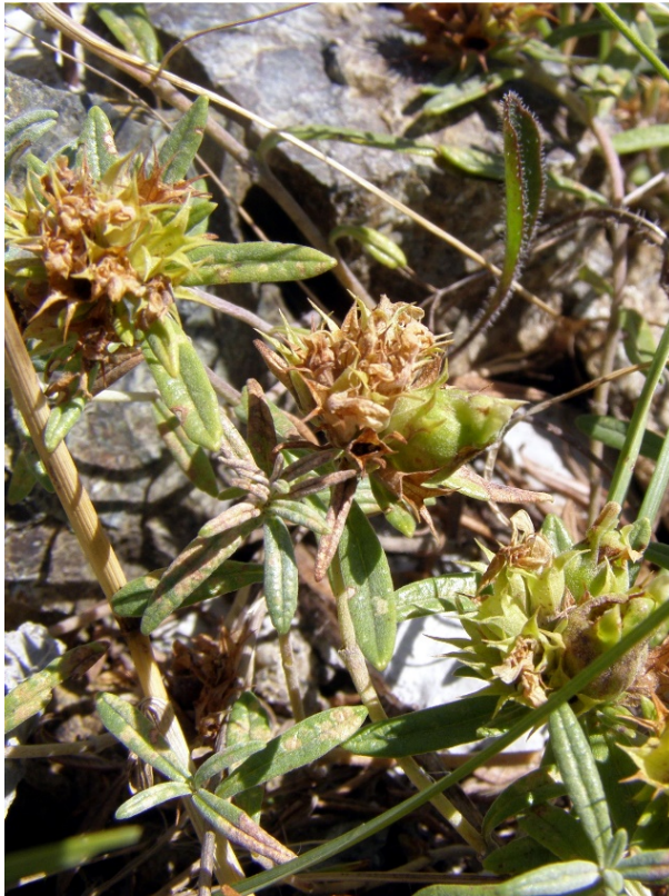
Figure 3. Teucrium montanum L. – white spots on leaves, caused by feeding of Hyalochiton komaroffii , and flower bud galls caused by Copium teucris teucris.