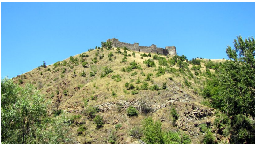
Figure 2. Habitat of Hyalochiton komaroffii (Jakovlev), Ibarska Klisura: slope below the medieval fortress Maglič.

The collected specimens are stored at the Natural History Museum in Belgrade within the Study Collection of Heteroptera.