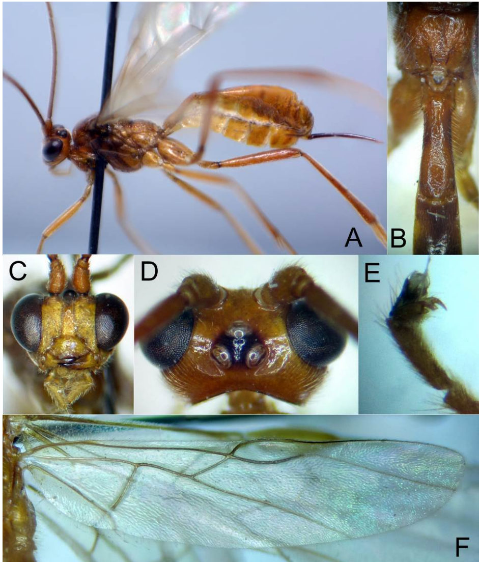
Figure 2. Homolobus (P.) annulicornis , female, A – general habitus, B – petiole, C – head frontal view, D – head dorsal view, E – claw, F – hind wing.

Analyzing the available material as well as the literature data, four species of the genus Homolobus are registered for the fauna of Serbia and Montenegro: H. (P.) annulicornis (Nees), H. (H.) discolor (Wesmael), H. (C.) infumator (Lyle) and H. (A.) truncator (Say) (Brajković, 1989; Žikić et al. , 2000, 2010; Papp, 2010). The sampling localities are given in the Fig. 1, with the exception of H. (H.) discolor .