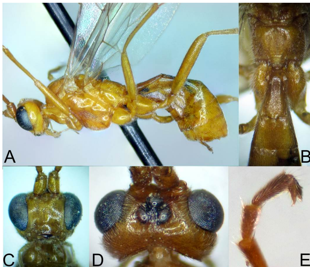
Figure 4. Homolobus (A.) truncator , female, A – general habitus, B – petiole, C – head frontal view, D – head dorsal view, E – claw.

Diagnosis (♀): Marginal cell of hind wing lacking cross vein; base of fore wing with distal part of 1A+2A straight; antennal segments 3-6 with a ridge on inner side as in H. (C.) infumator (Fig. 2F). Hind leg tarsus colored orange like tibia; tarsal claws with a small subapical tooth (Fig. 3E); ovipositor sheath a 1/4 as long as hind tibia (Fig. 4A); propodeum and metasoma orange; body color variable, from yellow, orange to brownish; body length 8.5 mm.