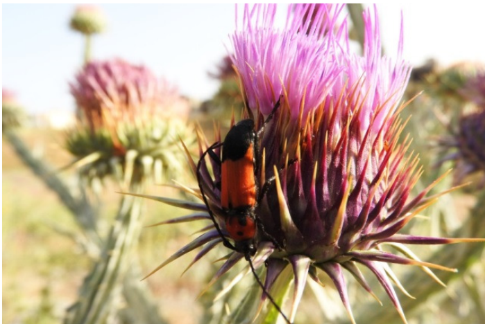
Figure 1. A female of P. desfontainii found on a flower of milk thistle.

Adult couples of P. desfontainii (50 males and 50 females) were hand-collected, conserved as dry specimens and deposited in the collection of the Department of Ecology and Environment, Faculty of Natural and Life Sciences, University of Batna 2, Batna, Algeria. Samples were photographed using a Nikon Coolpix P610 camera (16 megapixels) (Figs. 1 and 2) and measured using Digimizer Image Analysis Software (Version 5.4.3, MedCalc, Ostend, Belgium). Specimens were measured by analyzing 18 morphometric variables (body length and width, elytral length and width, head length and width, antennal length and length of each of antennomeres 1-11).