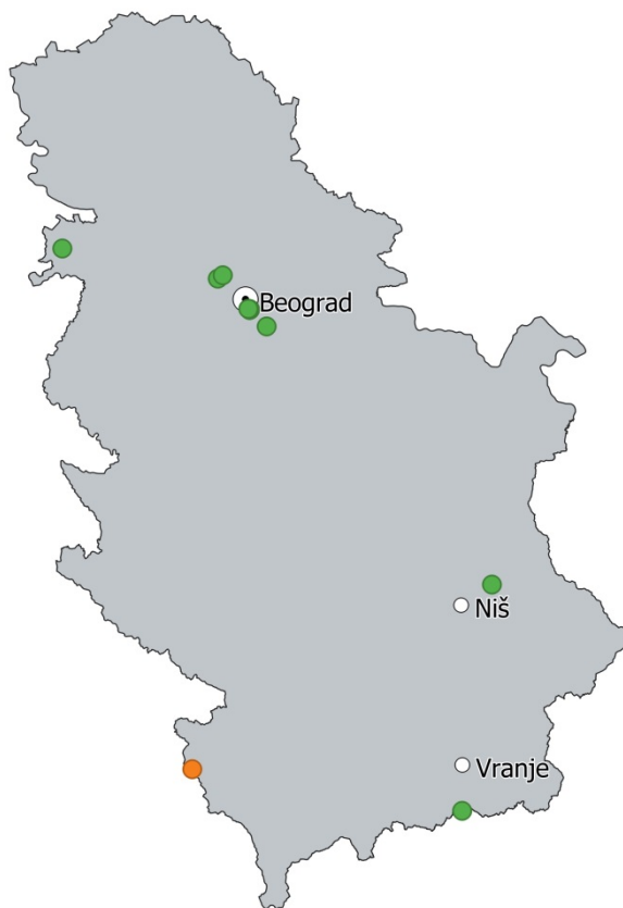
Figure 1. Perillus bioculatus distribution in Serbia (orange dot – literature data, source Protić & Živić, 2012; green dots – new data from 2018, 2021, and 2022).