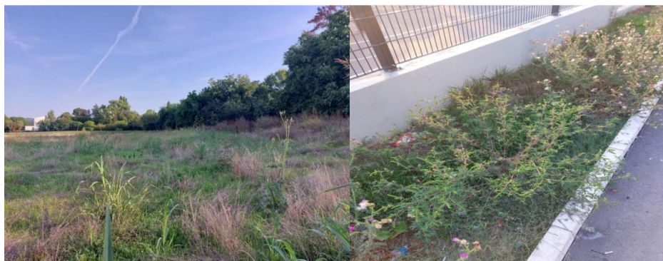
Figure 2. Locality in Banjica where P. bioculatus was found.