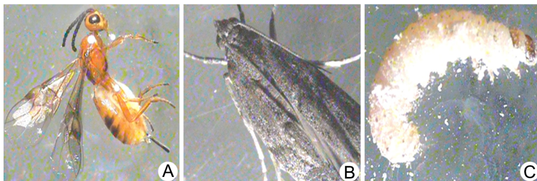
Figure 1. A – female wasp of H. hebetor ; B – female moth of E. kuehniella ; C – larval stage of E. kuehniella .

Flour moth eggs were from a private insectarium (Jalilian) from Eslamabad-e Gharb city in Kermanshah province, Iran, during 2018. Then, 0.25 g of the eggs were distributed on the surface of a wheat flour + bran mixture (750 g to 250 g) under the laboratory conditions at 20\pm 1^\circ\text{C} , 50\pm 5\% relative humidity (RH), and a relative dark (Abedi et al. , 2012, 2014; Mahdavi and Saber, 2013). Under these conditions, the pest moth (Fig. 1B) showed five larval stages (Fig. 1C) with a life-cycle period of about 40 to 45 days.