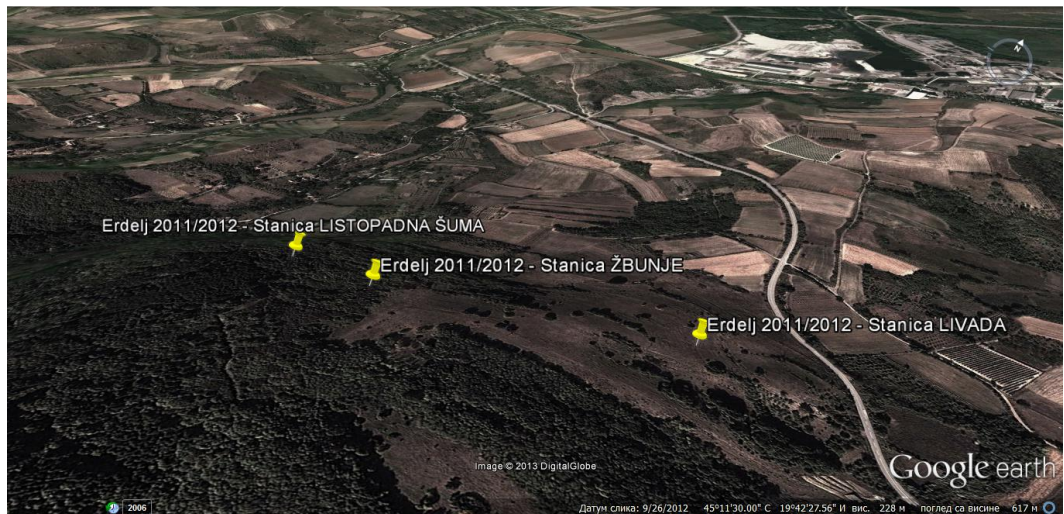
Figure 1. Erdelj, Mt. Fruška Gora, sampling plots written in Serbian language with clarification in English: LIVADA (meadow), ŽBUNJE (Shrubs) and LISTOPADNA ŠUMA (deciduous forest) during research in 2011 and 2012.

The three sampling sites in this campaign represent three different habitat types: meadow, shrub encroachment and deciduous forest, representing the three different stages of succession following the abandonment of the limestone mine. For better understanding on a local level, habitat types were on the map given in Serbian language: LIVADA (meadow), ŽBUNJE (shrub encroachment) and LISTOPADNA ŠUMA (deciduous forest).