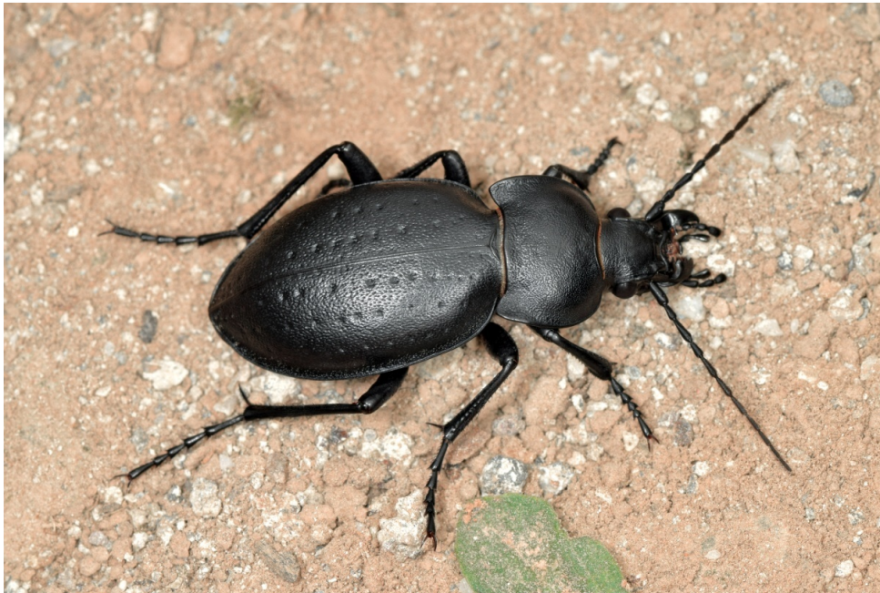
Figure 1. A female of Carabus hungaricus from the vicinity of Alibunar, a town on the northern edge of the Deliblato Sands.

Carabus hungaricus is an autumn breeder with winter larvae and overwintering adults. The longest life span observed in a capture-recapture experiment was five years for a female. The beetle's main activity period is in the autumn (mid-September to mid-October) when it reproduces. It has another, smaller peak of activity in the first half of June, when tenerals emerge (Bérces & Elek, 2013).