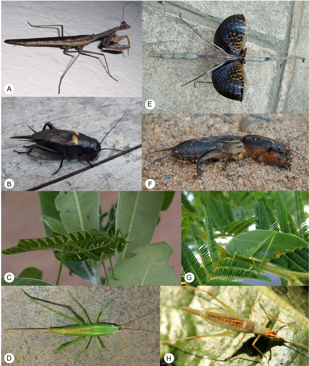
Figure 2. A) Polyspilota aeruginosa , B) Gryllus bimaculatus , C) Terpinistria zebrata , D) Conocephalus caudalis . E) Bactrododoma reyi , F) Gryllotalpa africana , G) Plangia graminea , H) Oecanthus capensis .