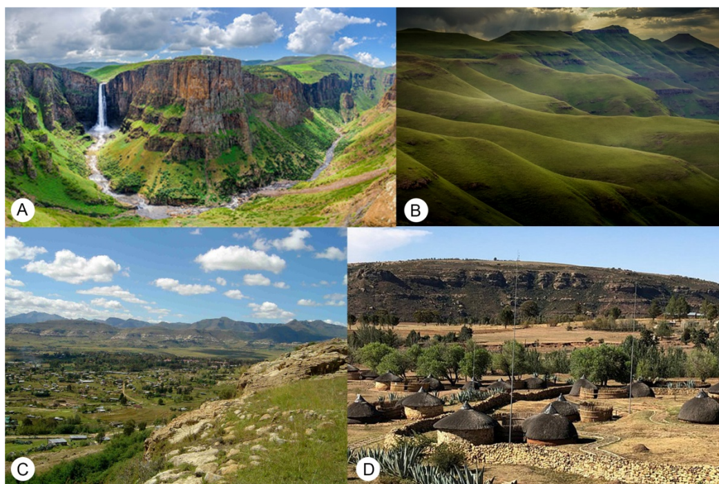
Figure 1. Lesotho, A) highlands around the Semonkong Waterfall; B) foothills around the Popa Mountain; C) lowlands (lowland/foothill borderline) in Roma Valley; D) lowlands along the sandstone cliffs in Nazareth.

The number of recorded species and genera in Lesotho are compared with those recorded in southern Africa (a region south of the Zambezi and Cunene rivers) to show what is known about the Lesotho fauna. This was done to facilitate further investigations of the orthopteroid fauna in this endemic region of Africa. Numbers of species and genera recorded in southern Africa are taken chiefly from Beccaloni (2014), Anon. (2015, 2022), Cigliano et al. (2019), and Brock et al. (2022).