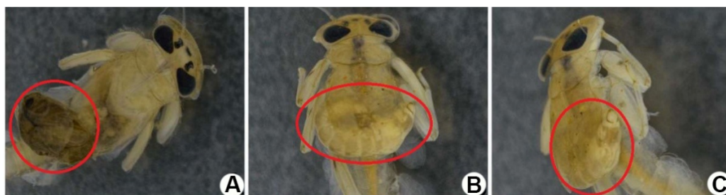
Figure 3. A – Pupa of S. rhithrogenae , dorsal view (red circle); B – Larva of S. rhithrogenae , dorsal view (red circle); C – Larva of S. rhithrogenae , lateral view (red circle).

The part of the Rača stream studied is characterized by a diverse community of macroinvertebrates, with 177 determined taxa from five taxonomic categories. The great diversity of these communities is mainly due to the numerous representatives of the family Chironomidae, of which 41 species were determined (Table I). The species Symbiocladius rhithrogenae was found only in three localities (RĈ1 (June 2011.), RĈ2 (May 2012.), and RĈ3 (May 2012.)) (Fig. 2) and represents the first record of this parasite in Serbia (Fig. 3).