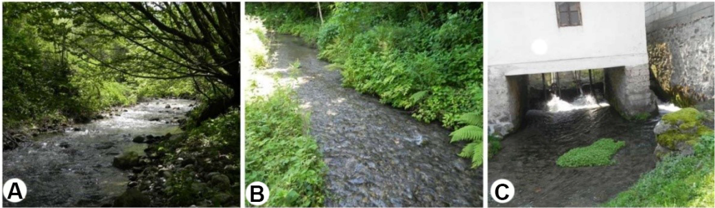
Figure 2. Sampling sites in the Rača stream where Symbiocladius rhithrogenae was found A – RČ1 locality; B – RČ2 locality; C – RČ3 locality (photo: Katarina Stojanović).

horizontal collapsible frame aligned against the water current took 10 min for each sampling. After thoroughly washing the net, the organisms left in the collection bag at the end of the net were placed in plastic bottles and fixed with 96% alcohol. After separating the organisms from mud, gravel, and detritus, they were identified to the lowest possible taxonomic categories, species (species group), or genera, except in the case of Hydracarina, which were not identified in this study. The material was separated and identified using a binocular magnifier (ZEISS Discovery V8 stereomicroscope) at the Institute of Zoology, Faculty of Biology, Belgrade, where the material is kept. For organism identification, the relevant literature was consulted (Langton, 1991, Schmid, 1993, Nilsson, 1996, Bauernfeind & Soldan, 2012). Photographs of the pupa and larvae of S. rhithrogenae were taken in the laboratory using a Leica DFC295 camera (Leica Microsystems, Germany).