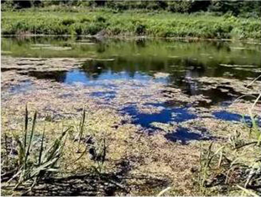
Figure 2. Typical habitat of C. lemnata (Savino Selo, Novi Sad, DTD canal).

Also, the hook row of the claspers on the last abdominal segment (X) is curved at both ends (Fig. 3C), whereas it is straight or only slightly curved in E. nymphaeata . Finally, the prothoracic shield is uniformly dark brown in C. lemnata (Fig. 3A), whereas in E. nymphaeata it has a dark central area (on both sides of the median line), while the other parts are lighter (light brown).