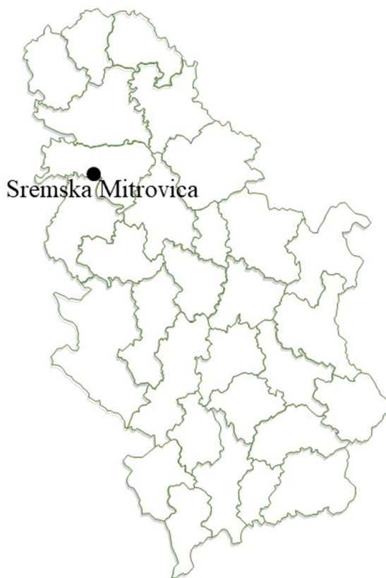
Figure 1. Collection locality of Stethorus ( Stethorus ) pusillus in Serbia.

Locality and date: City of Sremska Mitrovica (45°00'04" N, 19°38'12" E), northern Serbia, 25 August 2022 (Fig. 1).