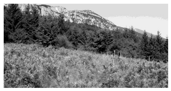
Figure 2. The foothill of Rtanj Mt..