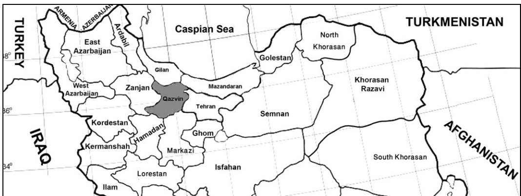
Figure 1. Iran's provinces where the Spilomyia species have been collected.

As a result of this study one species, Spilomyia triangulata van Steenis, 2000, is recorded for the first time from Iran. According to the results of the current study, the number of species of the genus Spilomyia in Iran increased to two species.