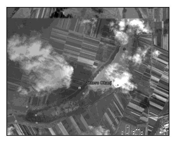
Figure 3. Pressure of agricultural land to the coastal salty marshes of Okanj Lake.