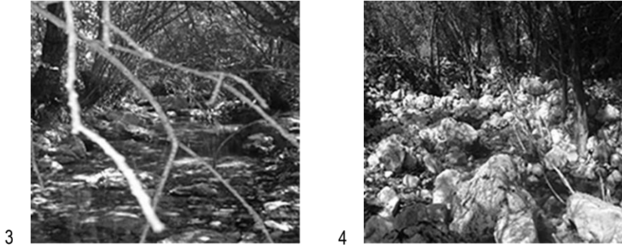
Figures 3 & 4. Habitat of the species Cordulegaster heros Theischinger, 1979 on the Boračka River

The finding of C. heros was expected in Bosnia and Herzegovina as this species is widely present in the Balkan region (Jović et al. , 2010). Further examination on Odonata should ensure more data on the presence of the Cordulegaster heros Theischinger, 1979 in this country.