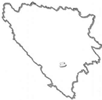
Figure 5. Relative location of the findings of the species Cordulegaster heros on the map of Bosnia and Herzegovina.